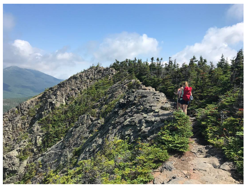
Just 30 minutes later, we were standing on Mount Liberty, looking out into the Pemi Wilderness. We snapped a couple photos but didn't spend any time on Liberty. We had bigger fish to fry.

To keep the distance manageable for a day hike but still tag all the Pemi Loop summits, we spotted a car at the Lafayatte Place Campground lot, headed back to Lincoln Woods and set out clockwise up Osseo Trail toward Franconia Ridge. It was an absolutely beautiful day, and we summited Flume just after 10am and spent a half hour basking in the sunshine and snacking. Morale was high again!