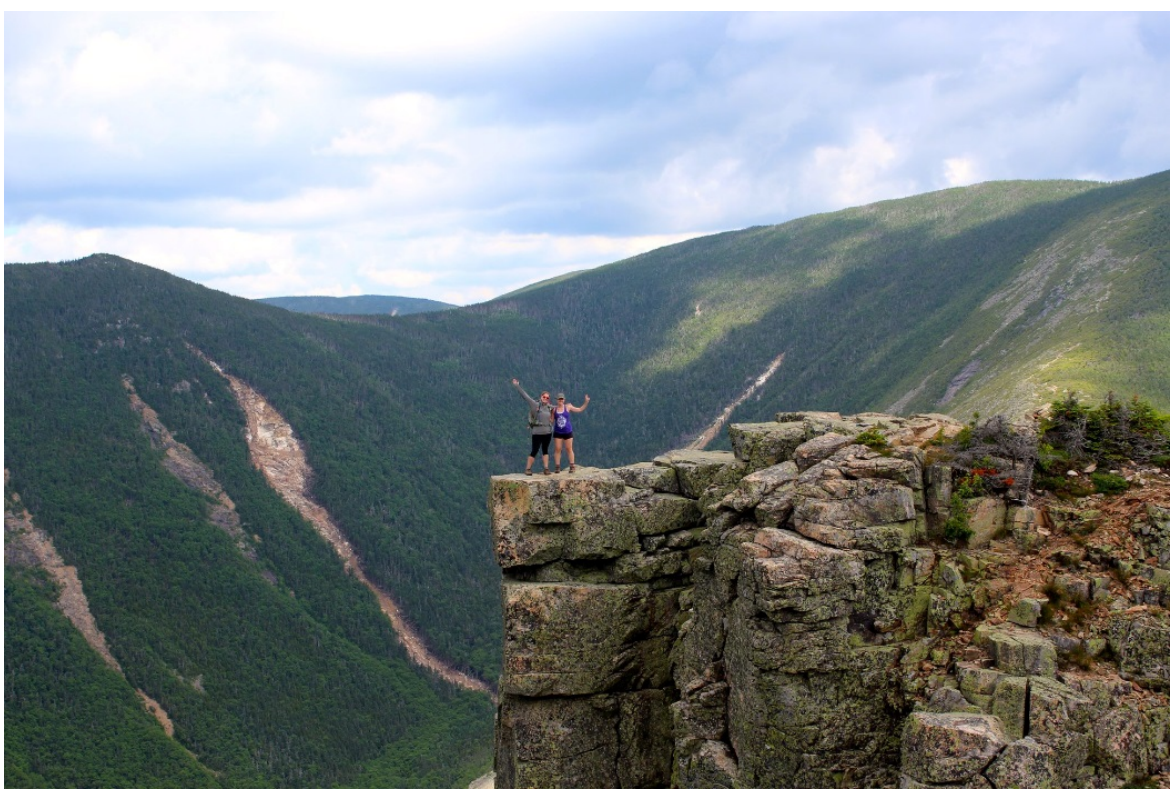
This was my first time hiking in the Pemi Wilderness, and the hike from Bondcliff> Bond>West Bond>Guyot is breathtakingly beautiful. The best part in my opinion is being able to drop your pack to do the quick .5 mile out to tag West Bond for the most epic views of the Pemi Wilderness.